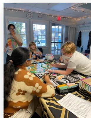
Pizza & Games!