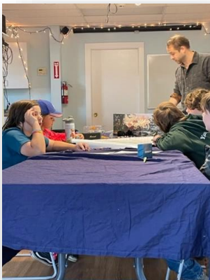
Dungeons & Dragons!