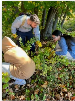
Rooting out the invaders.