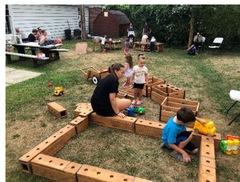
Outdoor Play Space Page 2