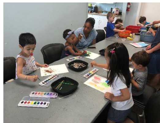
Preschool Programs Page 2

This program introduces the exotic world of bats and echolocation. Children will create unique bat t-shirts, using a combination of fabric dye sprays, plants, and cut outs. Children may purchase white t-shirts for $4.00, or bring their own.