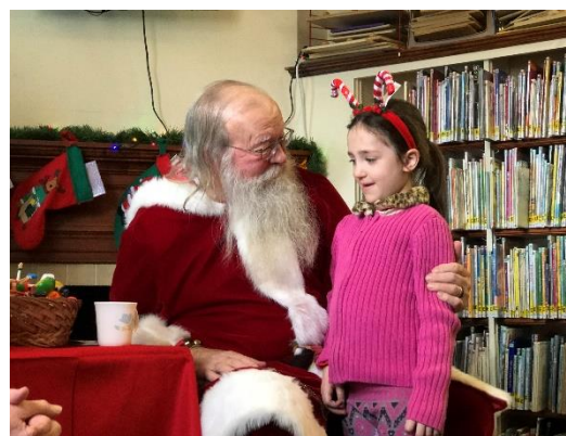
Santa and December Page 4