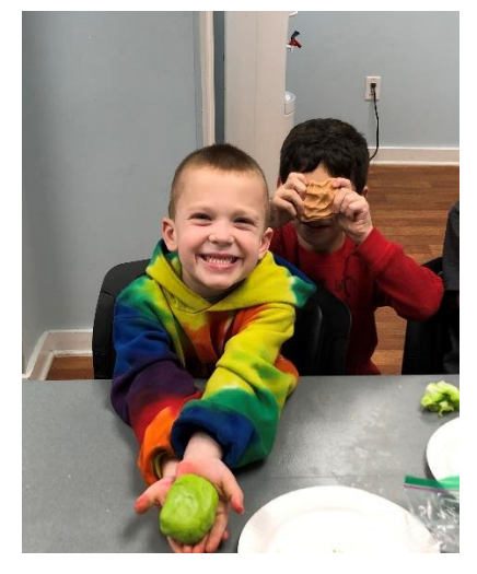
Art and STEAM Page 3/4